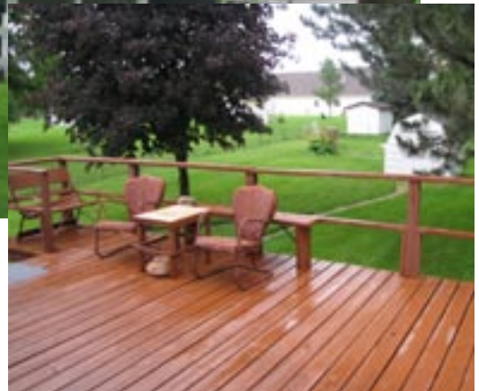
Split level with fenced backyard & deck